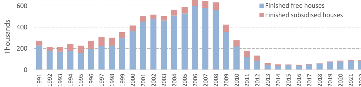
Evolution of finished homes in Spain: free to sell and subsidized, 1991-2022.

We believe that the most relevant part of this project is the one that refers to the accessibility to housing, one of the biggest problems for the Spanish society, especially for the working class and the young people . After the pandemic, the situation of the housing market in Spain is facing a significant shortage of supply, especially in large urban areas, and even more notably a shortage of subsidized housing , with Spain being one of the countries in Europe with the least social housing per number of inhabitants. Our most important responsibility as developers is improving accessibility to housing for the segments of the population that need it the most and for young people, and in areas within or close to large urban centers , as well as to contribute to the well-being of the people who live in our homes. One example of this commitment the major development we are carrying out in the municipality of Alovera, in an area very close to Madrid.